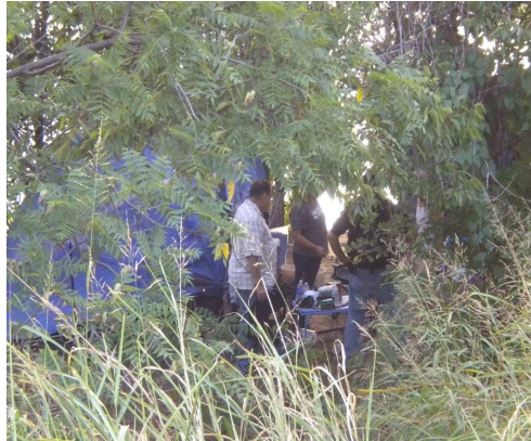
Ministry at a tent by the river