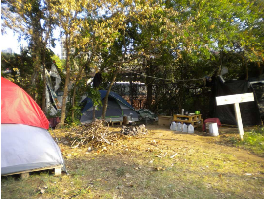
One of the neater camps