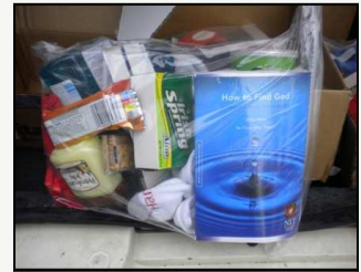
Packets of supplies are carried to receivers by backpack